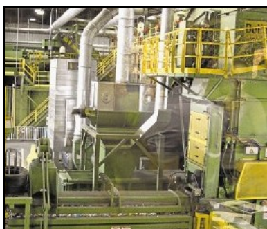
We toured Waste Management's new Materials Recovery Facility ("MRF") in Houston. Facilities like this greatly reduce the manual labor involved in sorting and processing valuable recyclables.