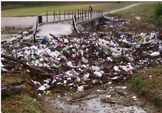
Sycamore Creek Golf Course near Ft Worth sees the effects of discarded beverage containers washed down stream after a storm.