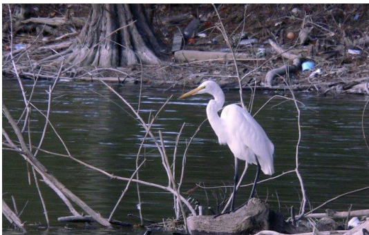
Beautiful Snowy Egrets are a common sight at Lake Houston. Unfortunately, too often discarded beverage containers at the lake are also a common sight.